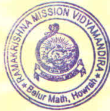
Signature of the HoD