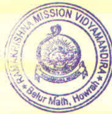
Signature of the HoD